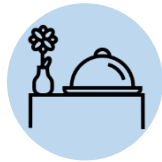
Breakfast in Bed