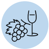
Bottle of Fruit Wine